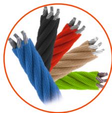
Polypropylene ropes pp - multisplit type with a steel core and a diameter of 16 mm