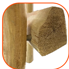
Natural robinia wood